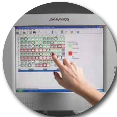
Touch screen navigation puts results at your fingertips!