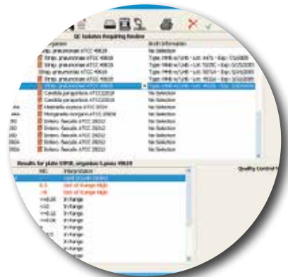
Drop down fields eliminate difficult codes and numbers, eliminating manual entry errors.